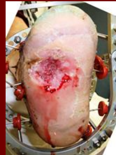
Ulcer after 4 weeks of adjunctive treatment