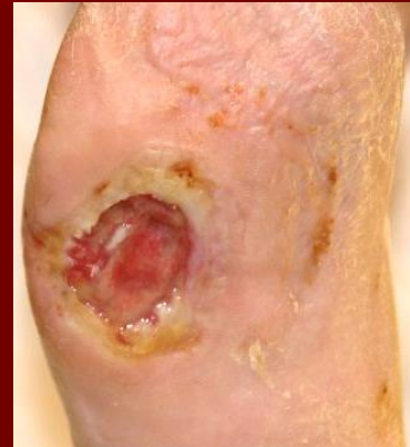
Initial Presentation of Ulcer