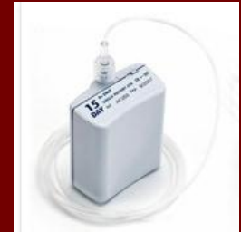
Transdermal Oxygen Therapy Unit